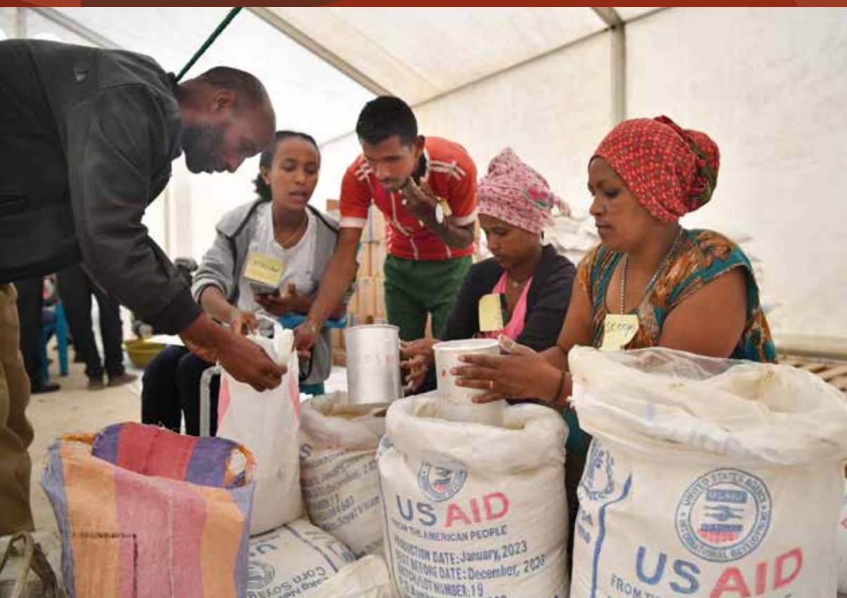
Refugees at Alemwach refugee camp, Ethiopia, receiving food assistance.

WFP provides food assistance to nearly 900,000 refugees in Ethiopia and also supports refugees in Somali, Gambella, Benishangul Gumuz, Oromia, SNNP and Afar regions of Ethiopia, providing refugees with cereals, pulses, vegetable oil and salt.