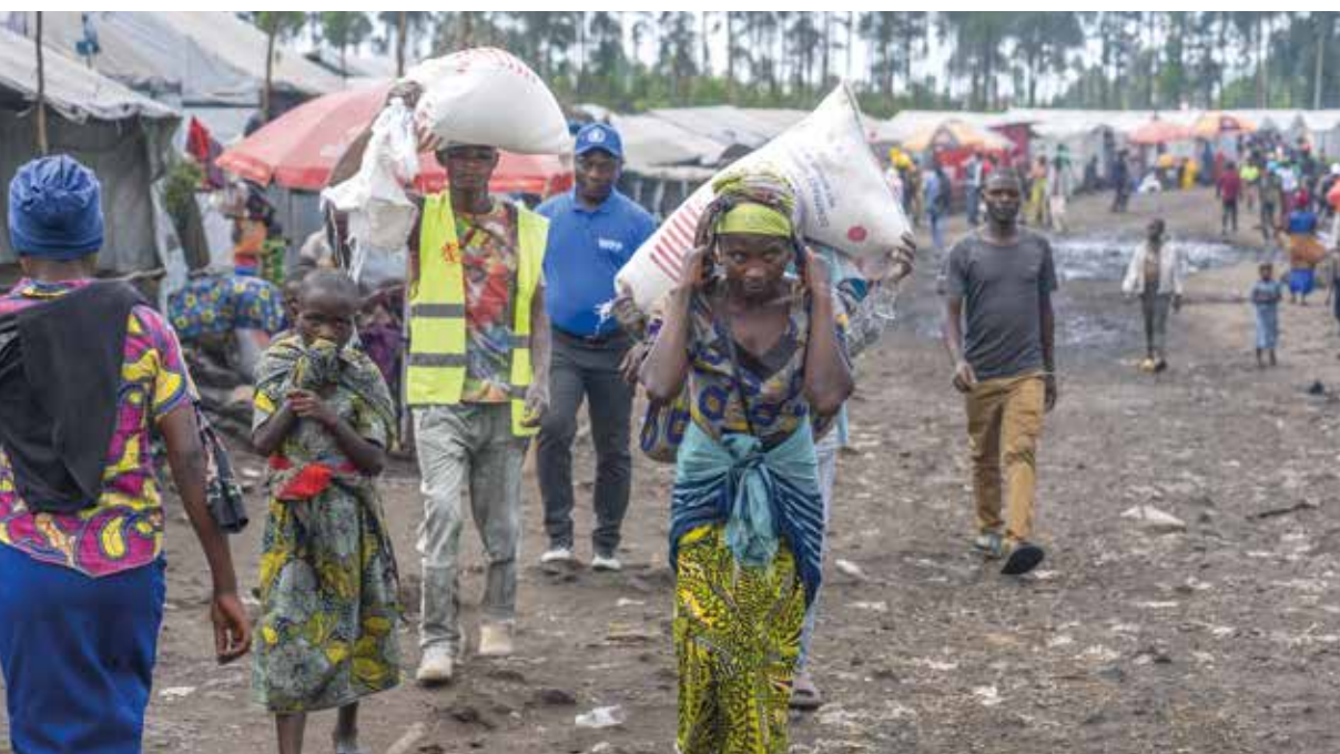
Food distribution in Rusayo, Democratic Republic of the Congo (DRC).

This section provides an overview of the key findings from the assessment, focusing on areas of strength and outlining issues that WFP will still need to address to ensure it remains fit for the future to fulfil its mandate of working to end world hunger and promote nutrition and food security through saving and changing lives.